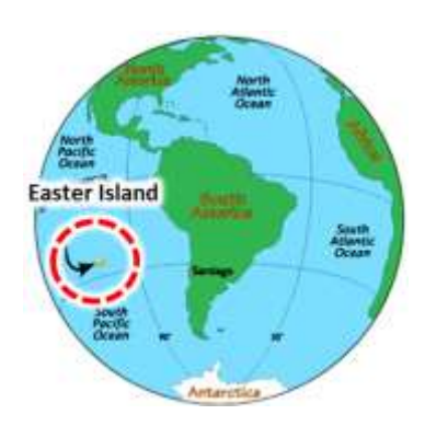
Figure 1 Location of Easter Island on the Globe.

It was this Easter Island society that built the famous statues and hauled them around the island using wooden platforms and rope constructed from the forest. The construction of these statues peaked from 1200 to 1500 AD, probably when the civilization was at its greatest level. However, pollen analysis shows that at this time the tree population of the island was rapidly declining as deforestation took its toll.